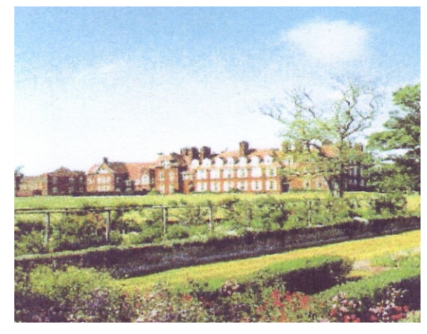
Saint Felix School, Southwold IP18 6SD

you bring your bokken and jo, plus of course the all important proof of BAB insurance. Contact 01502 565374/515062 or www.broadland-aikido.co.uk for more information.